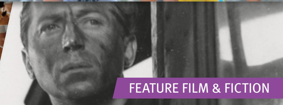
FEATURE FILM & FICTION